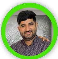
Network Marketing Professional