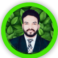
Doctor / Therapist