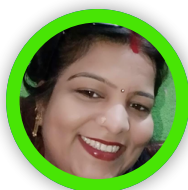
Work From Home